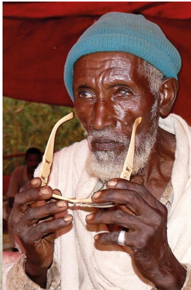
His right eye was almost blind and was healed.