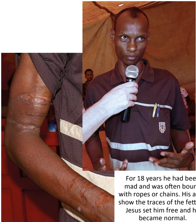
For 18 years he had been mad and was often bound with ropes or chains. His arms show the traces of the fetters. Jesus set him free and he became normal.