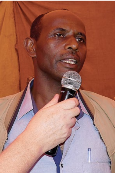
He had suffered from asthma for 13 years. Healed!