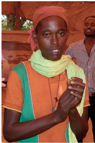
This young woman had been deaf and mute since her childhood. She could not hear anything nor speak. Someone brought her to the meeting and Jesus healed her. She still has to learn how to speak.