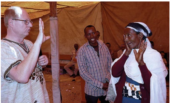
Her left eye had been blind for four years.