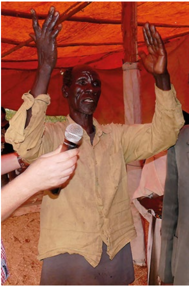
He had suffered from epilepsy since childhood.